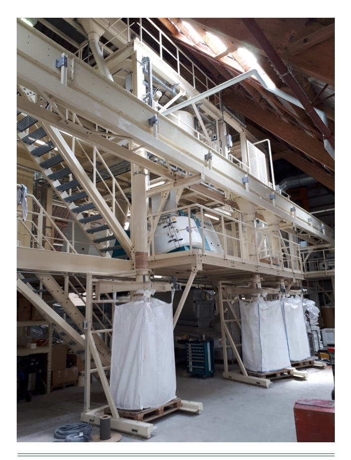
Figure 4. Fertilizer plant.

Many industries also take advantage of the mixer's ability to dry materials. For some applications, convection drying plants