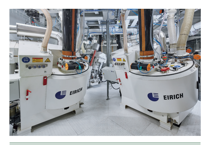
Figure 3. Fertilizer plant.

picked up and moved around. This results in slow tool speeds, and a low energy input into the mixture, resulting in long preparation times.