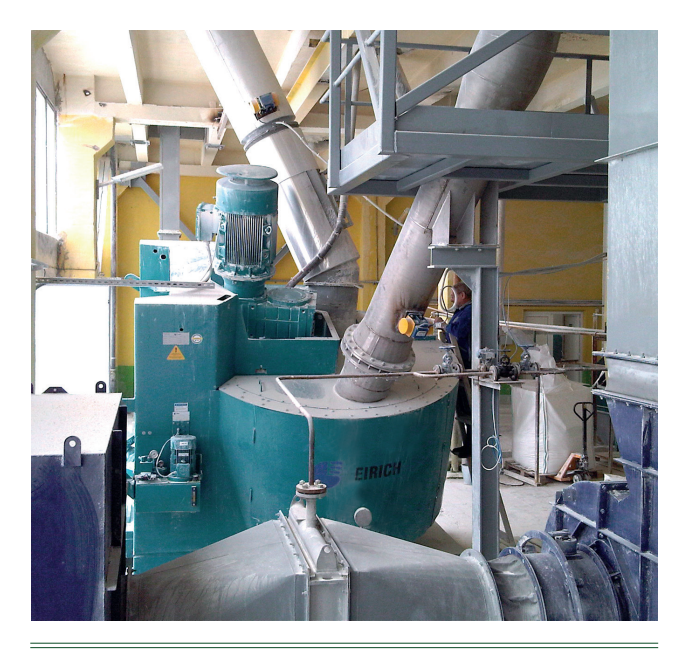
Figure 2. EIRICH mixer.