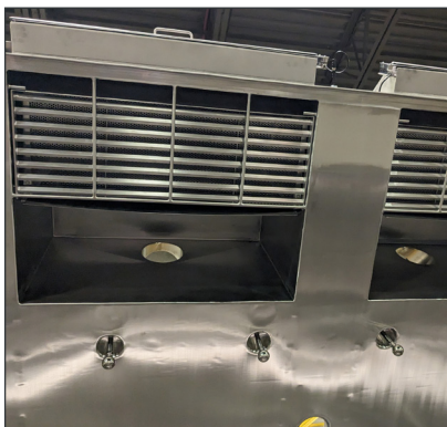
Filtered/non-filtered bag dump stations Clean-in-place kits