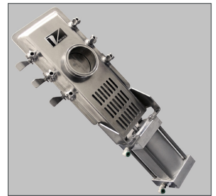
Sanitary Quick Clean Gate