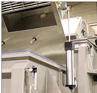
Pneumatically actuated cover