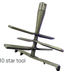
EL10 star tool