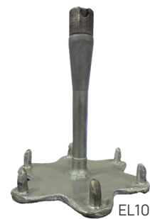
EL10 pin tool