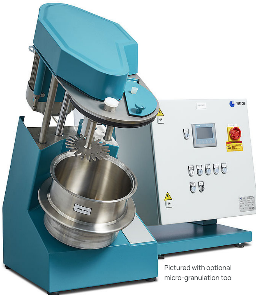
Pictured with optional micro-granulation tool