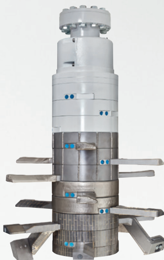
Star-type rotor Beaters in different wear protection designs