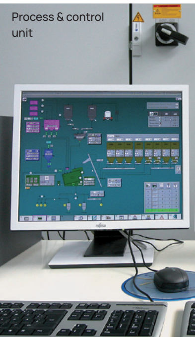
Process & control unit