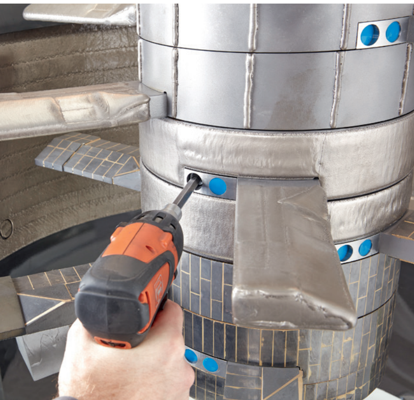
The patented SmartFix quick-change system

With our services, we specifically address to your wishes.