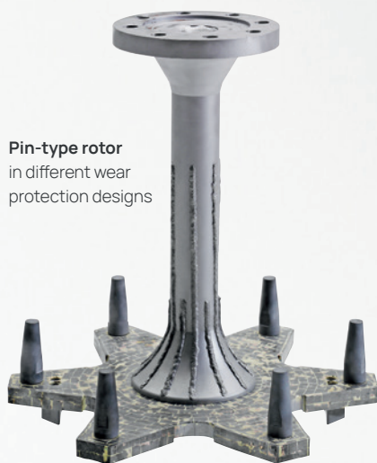
Pin-type rotor in different wear protection designs