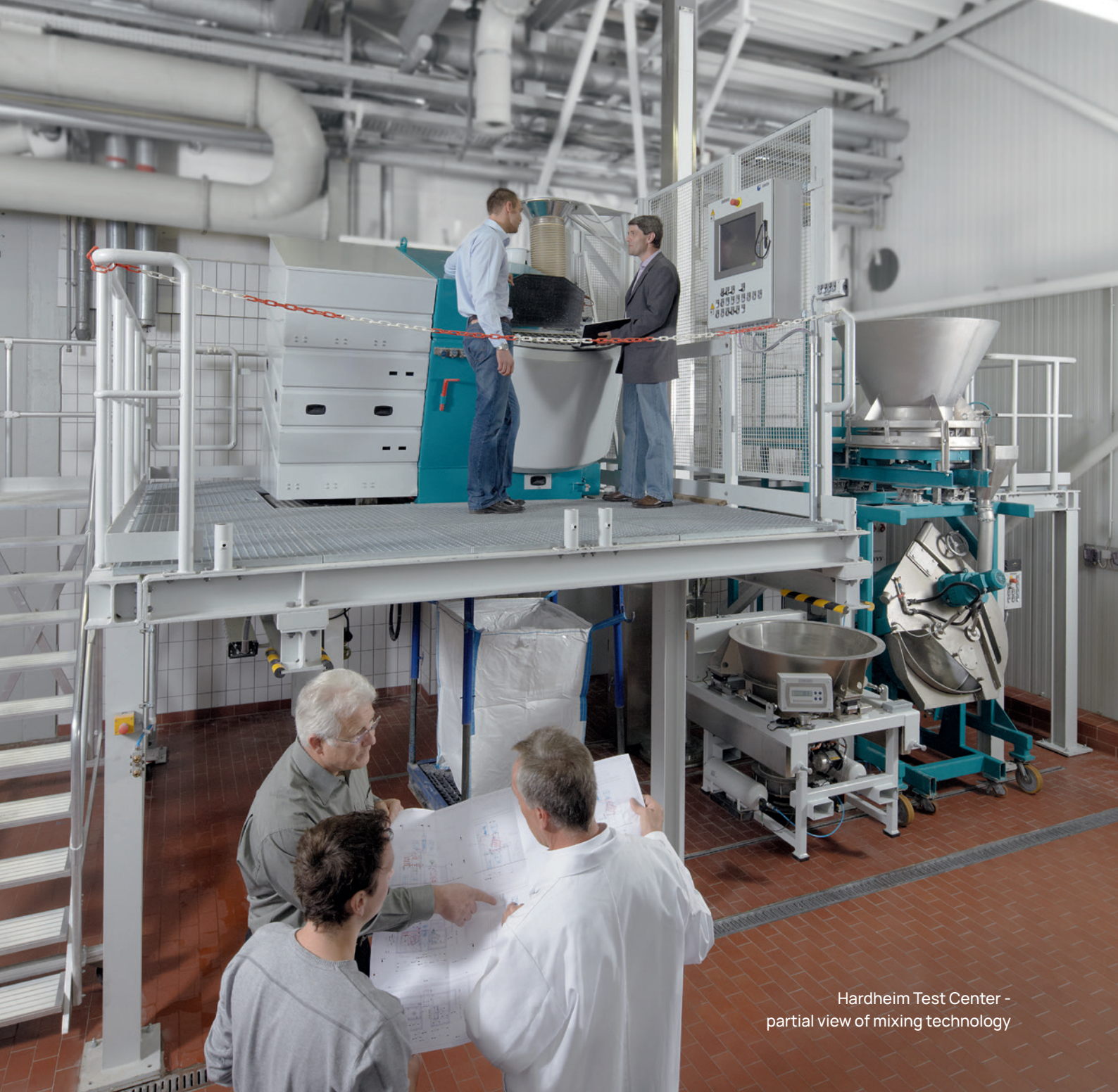
Hardheim Test Center - partial view of mixing technology