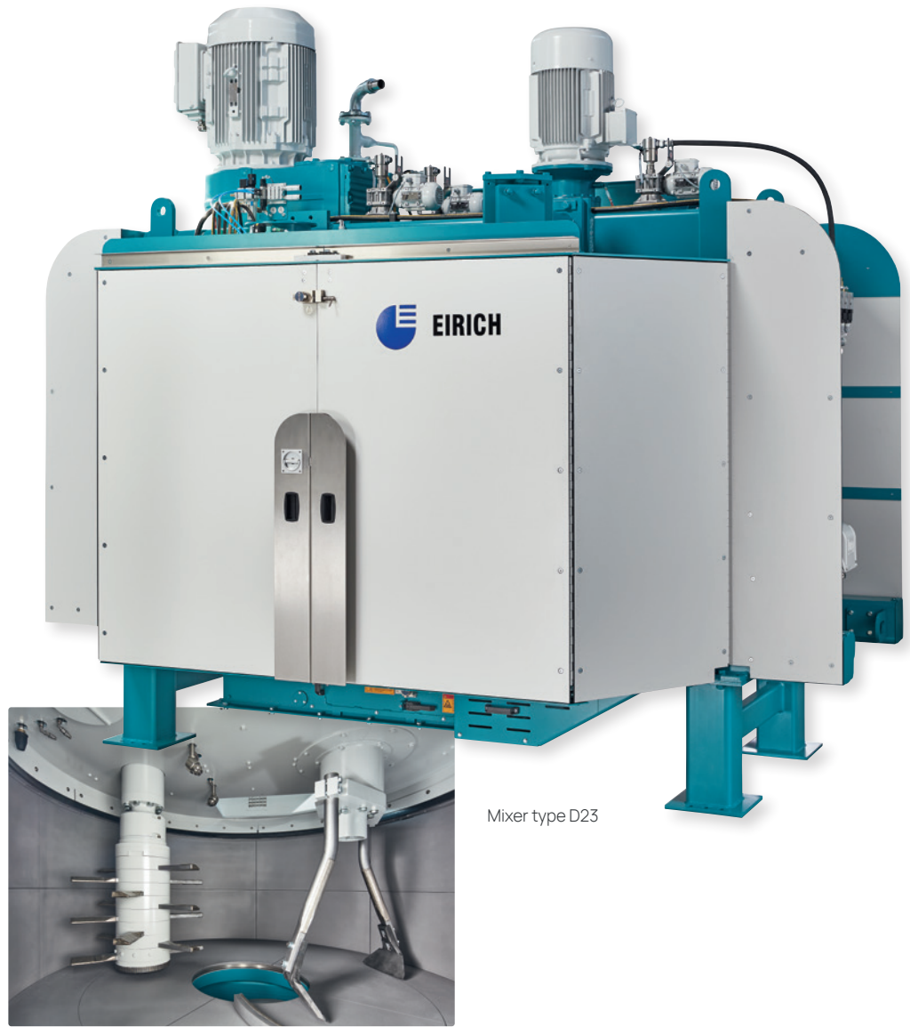
Mixer type D23