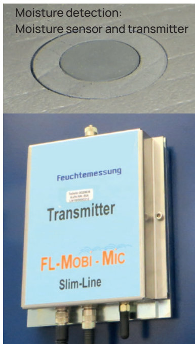
Moisture detection: Moisture sensor and transmitter