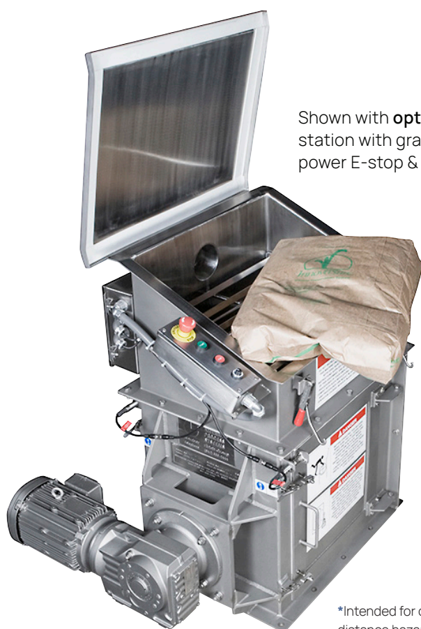
Shown with optional hand-add station with grating, and optional power E-stop & PB station.*